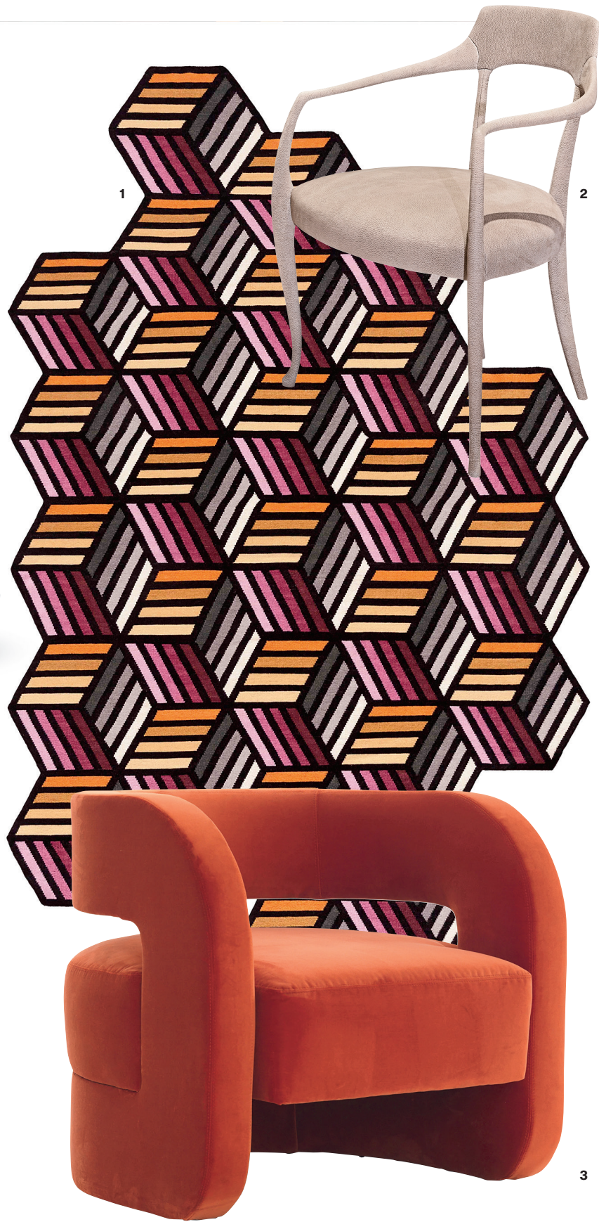
1. The Parquet collection of wool kilim rugs from Gan comes in a range of different geometric shapes, from $1,470; gan-rugs.com .