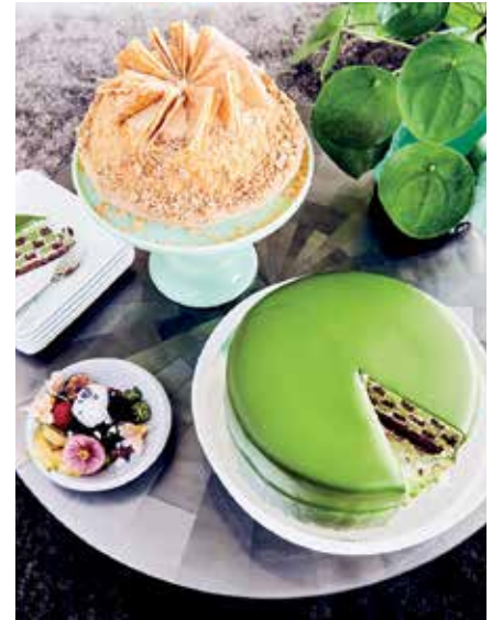
From left: Dessert in the living room, which has sofas from Mitchell Gold + Bob Williams and a silk rug from Fort Street Studio; cakes from Lady M served on a cocktail table from Oly.

Asian food-travel show on PBS, Lucky Chow , which is currently airing its third season.